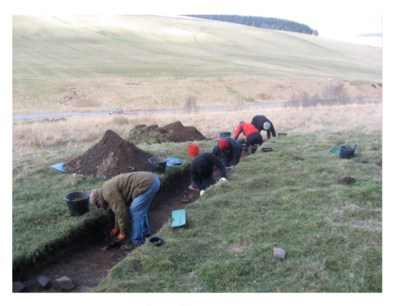
Fig 2 Excavation in progress in Trench 1, March 2013